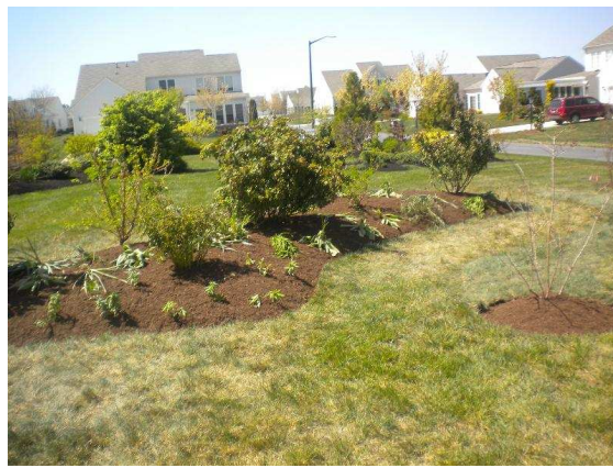
An irregularly shaped garden graces the front yard.

You may want to keep this in mind, when selecting new plants for your garden.